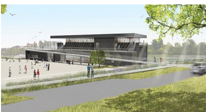
Hugues Architects Mulhouse

ArtRhena: Cross-border cultural centre on the Rhine island between Breisach and