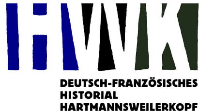
Deutsch-Französisches Historial Hartmannswillerkopf

Historial auf dem Hartmannswillerkopf: German-French World War I Memorial on the Hartmannswillerkopf